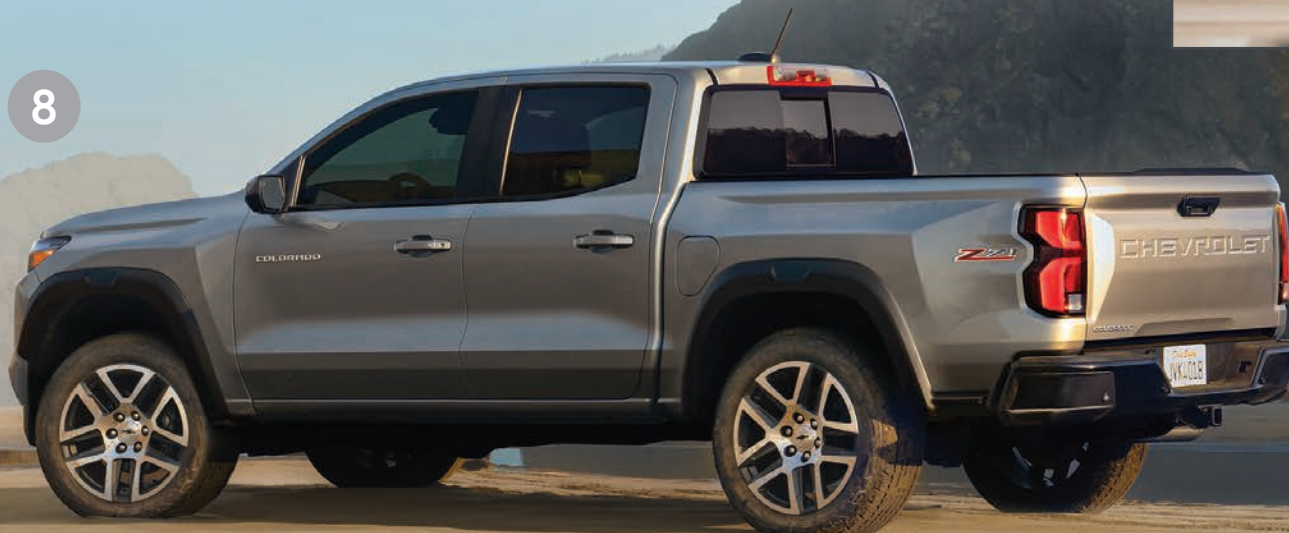
2023 Chevrolet Colorado

Preproduction model shown. Actual production model may vary. Available early 2023. Due to current supply-chain shortages, certain features shown throughout have limited or late availability, or are no longer available.